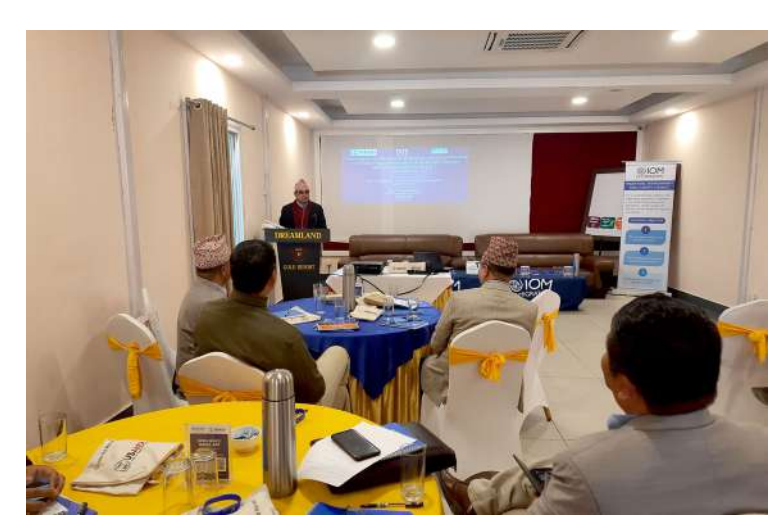
Provincial Closing Event, Lumbini Province.