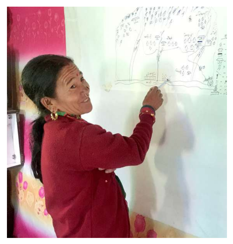
Ward Member from Chankheli Rural Municipality Presenting during Local Level Training.

At the local level, project reached out to all local levels including the remotest local governments with trainings on DRRM Localization Manual. Furthermore, technical support was provided on DRRM legislative framework based whenever there was request from the local government.