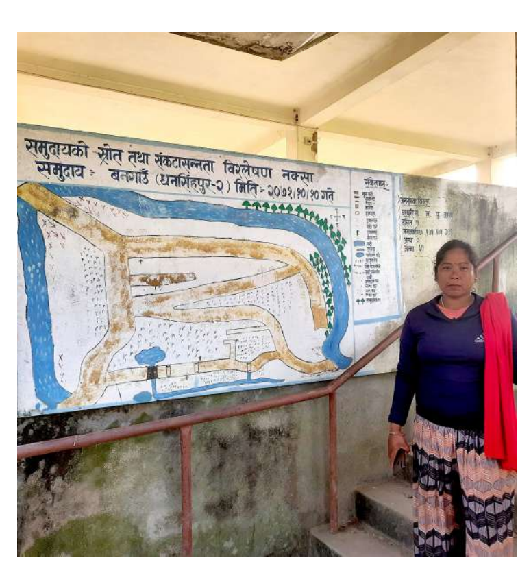
Local Resource Map, Tikapur Municipality..