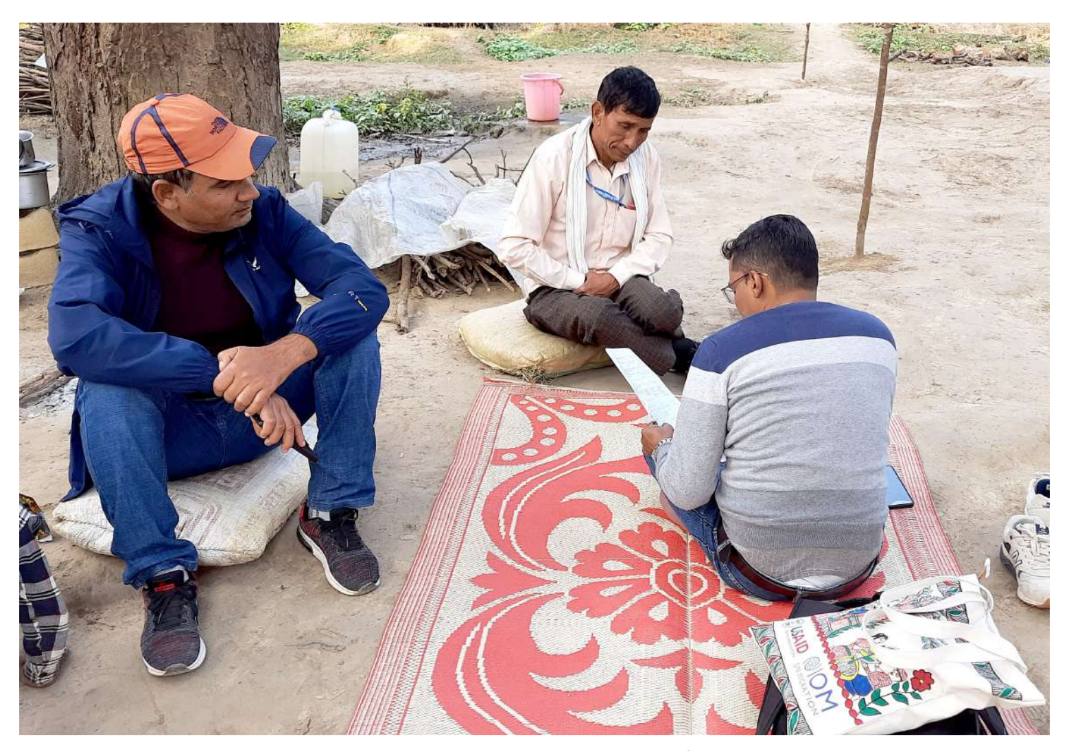
Key Informant Interview with Ward Chair, Kailari Rural Municipality.