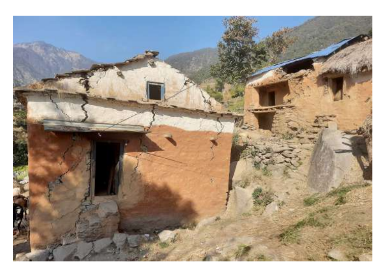
Purbichowki Rural Muncipality.