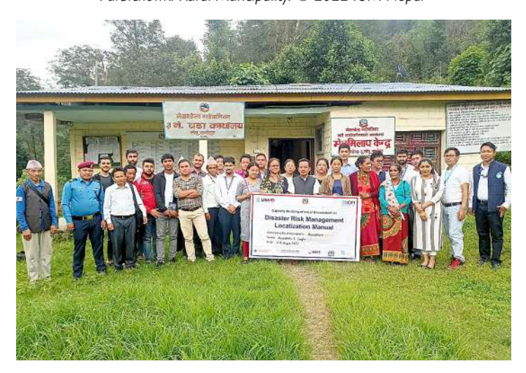
Group Photo, Maiwakhola Rural Municipality.