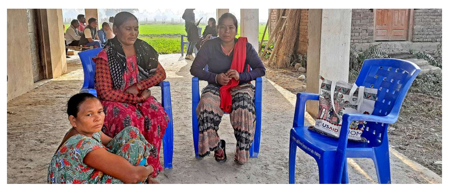
Discussion with Community Members, Tikapur Municipality.

Additional 7 episodes were developed and broadcasted focusing on COVID-19 preparedness and response efforts of Government of Nepal. These episodes covered the efforts of federal, provincial, and local governments for COVID-19 preparedness and response, awareness message to public and key suggestion to the government from experts on COVID-19 preparedness and response.