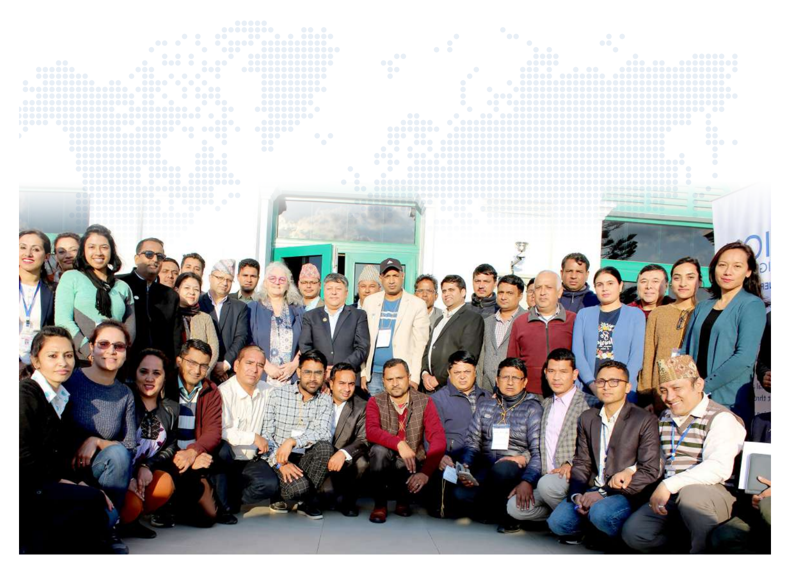
Group Photo, National Master Training of Trainers.