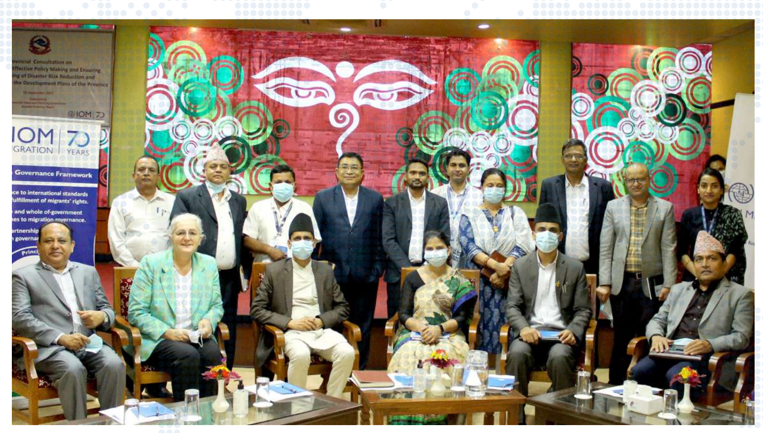
Group Photo PPC Consultation, Gandaki Province.