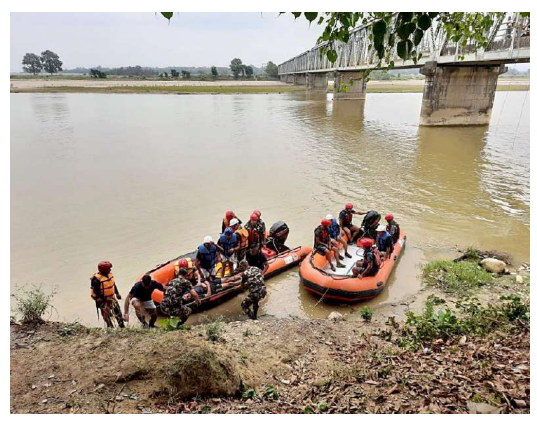
Provincial Water Induced Disaster Simulation Exercise, Lumbini Province.

A total of 573 people ( 521 males and 52 females) participated in the simulations.