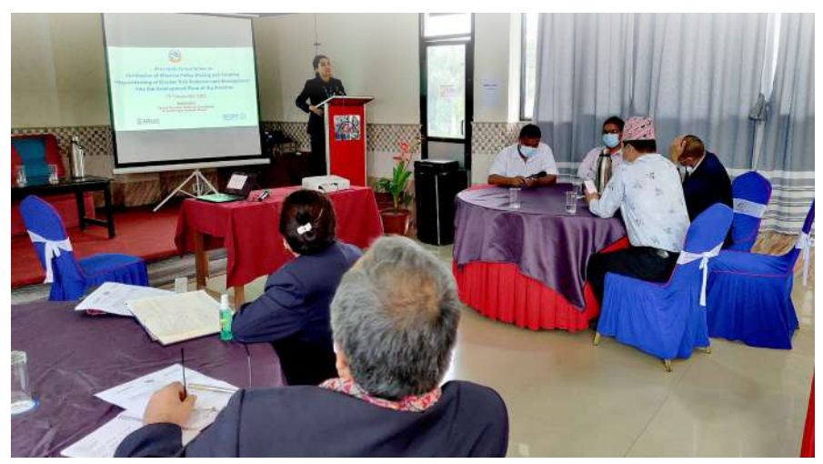
Consultation Session, Karnali Province.

A first round of introductory consultation was conducted in 2020 under the leadership of provincial planning commission and representation of Provincial Government to share and discuss on the process and mainstreaming DRRM into the planning process and policy documents. This effort was continued in the second round of the consultations and technical workshops to update and mostly follow up on the recommendation received from the first round and provide technical assistance to Provincial Planning Commissions (PPCs) to mainstream DRRM in the formulation of the periodic plan and programs.