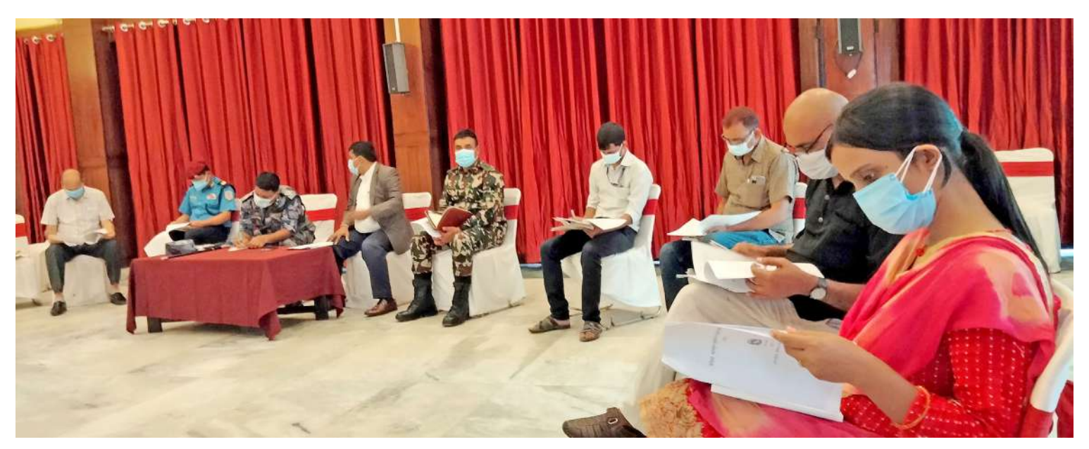
Monsoon Emergency Response Plan Finalization Program, Madhesh Province.

In Province 1, the project also helped organize two events for the finalization of Provincial DRRM Policy and Strategy document. The DRRM Policy and Strategy is expected to support in the implementation of the DRRM Act 2017 and localization of DRRM. The contribution by the project was widely appreciated by respective provincial ministries, and lead UN agencies as well as humanitarian clusters.