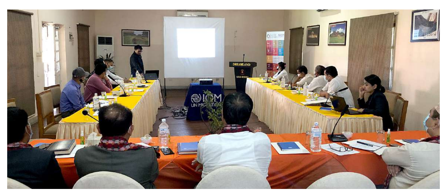
PPC Consultation Session in Progress, Lumbini Province.

The project conducted consultative workshops under the leadership of provincial assembly speakers, and representing MPs, and under the leadership of the Deputy Speaker of the Provincial Assembly and elected women representatives to share and discuss their role on the process of mainstreaming DRRM into the legislation process and policy documents, and for improving coordinated actions for inclusive DRRM.