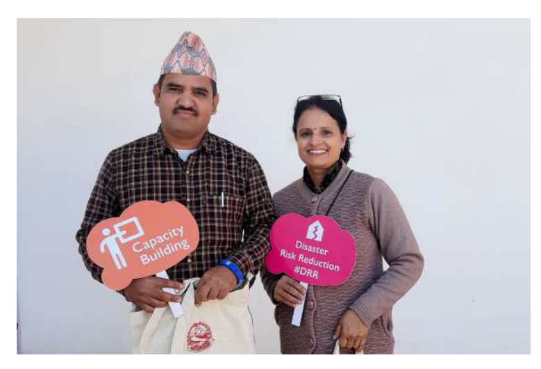
Master Trainers, Lumbini Province.