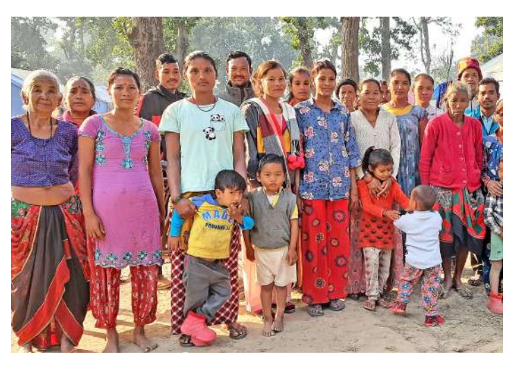
Displaced Community in Temporary Shelter, Kailari Rural Municipality.