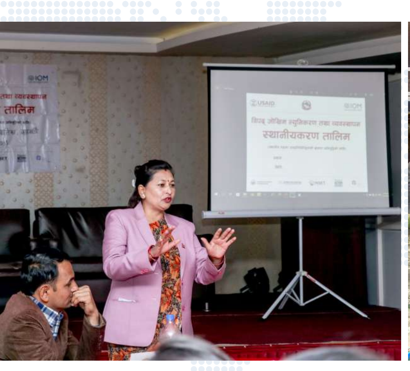
Training in Progress, Nagarjun Municipality.