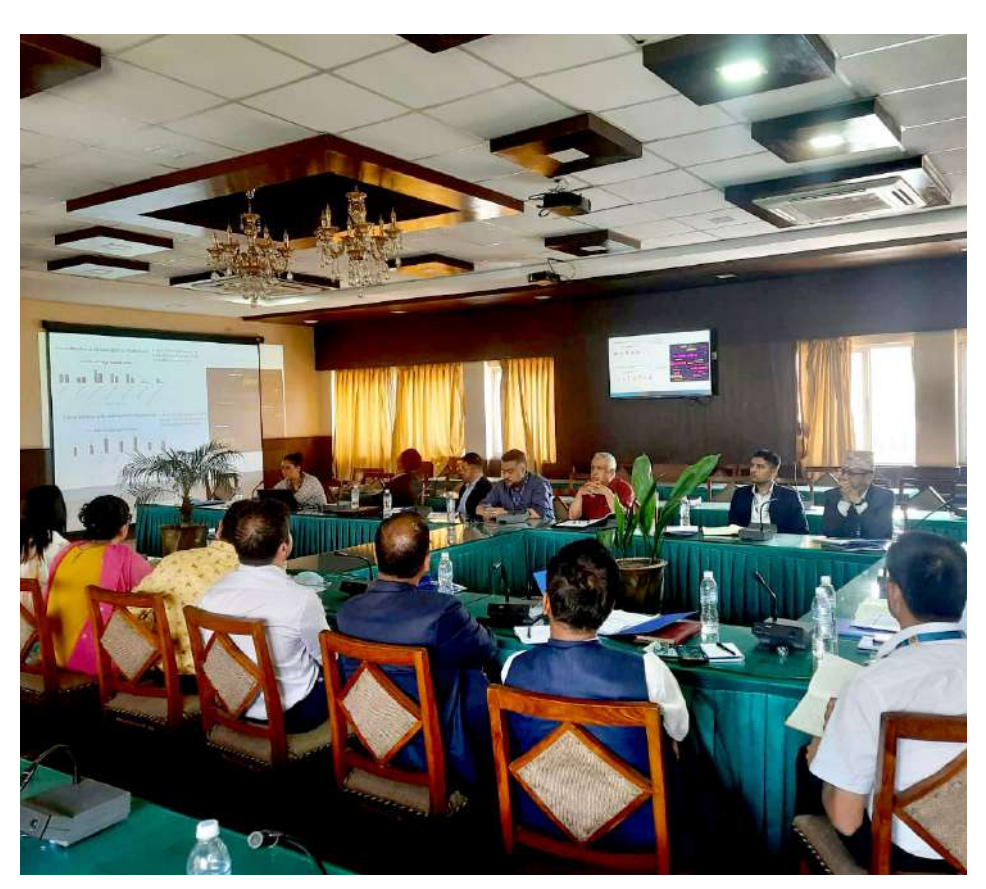
Project Advisory Committee Meeting Convened at Ministry of Federal Affairs and General Administration.

The project, under leadership of Ministry of Federal Affairs and General Administration (MoFAGA) and guidance of Project Advisory Committee (PAC), supported the federal government to improve and institutionalize disaster risk reduction and management work and practices in line with new laws and policies. IOM established a 'Project Advisory Committee (PAC)' chaired by Joint Secretary of MoFAGA and has members representing from Ministry of Home Affairs (MoHA), National Disaster Risk Reduction and Management Authority (NDRRMA), Ministry of Forest and Environment (MoFE), Ministry of Urban Development (MoUD), National Planning Commission (NPC), Municipality Association of Nepal (MuAN), Network of Rural Municipalities (NARMIN) and IOM for a coordinated approach to DRRM. The project was implemented in close coordination with MoFAGA at federal level, and Ministry of Internal Affairs and Law (MoIAL) at provincial level. In due coordination with federal and provincial government, strengthening of capacity of all local levels on DRRM was carried out.