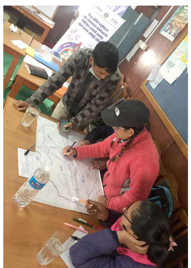
Risk Mapping, Local Level Training.