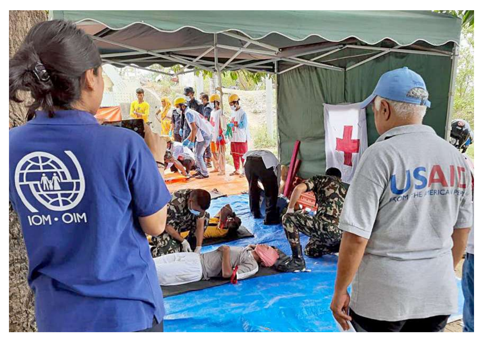
Provincial Water Induced Disaster Simulation Exercise, Lumbini Province.